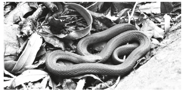
The huge diversity of animals, plants and birds exist and each plays an important part in the rainforest ecosystem.

Vehicle entry and camping fees apply in Mebbin National Park. These fees are used locally to help protect the park and maintain its facilities. If you are a regular national park's visitor you can save money by purchasing an annual pass.