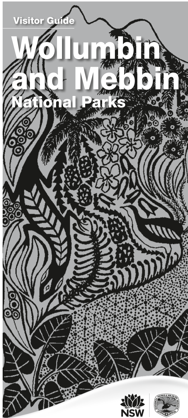
cover illustration by Mark Daemon