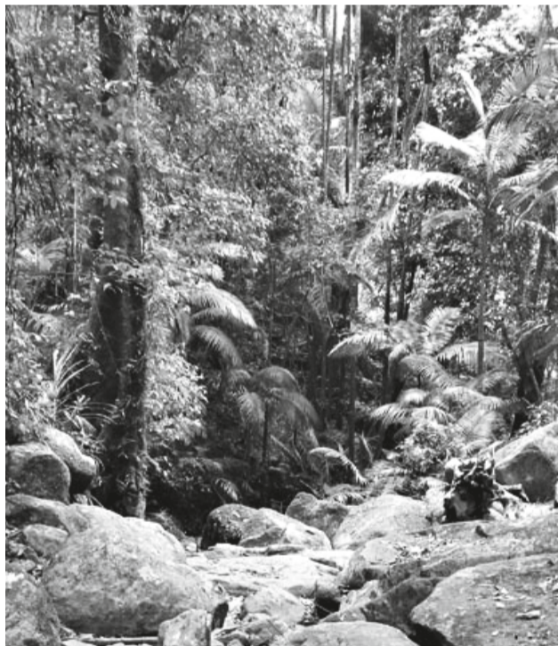
Hike this winding path under towering palms listening out for the calls of whipbirds, noisy pitta and lyrebirds.

Please note that in wet weather the roads into Mebbin National Park can become slippery. In these conditions the western section of Wollumbin National Park may be closed to vehicles. If you are visiting Mebbin National Park in these conditions it is not advisable to go beyond the camping area.