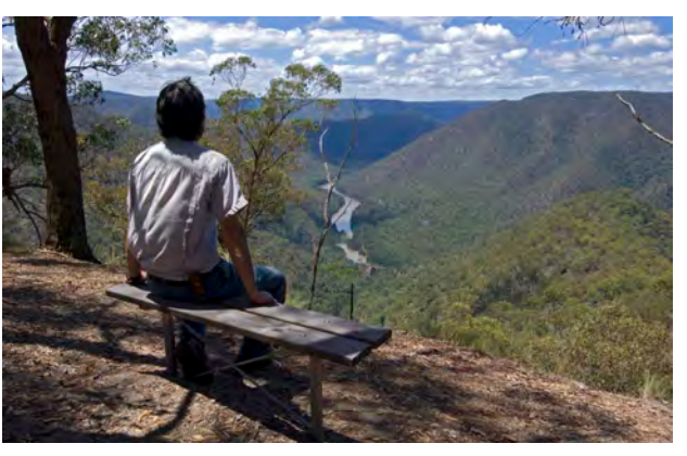
Enjoy stunning views across the Shoalhaven River from Mt Ayre