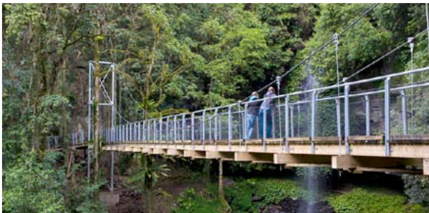
Suspension bridge at Crystal Shower Falls