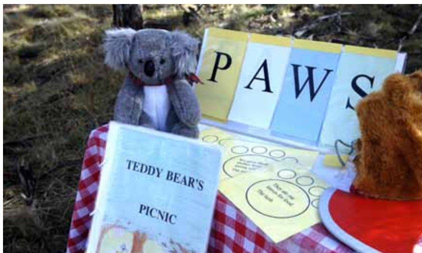
The Teddy Bear's Picnic is an engaging and active day in the national park