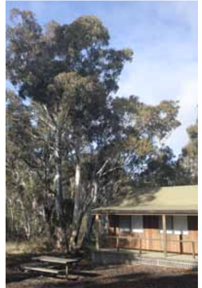
Summer classrooms at the Kosciuszko Education Centre