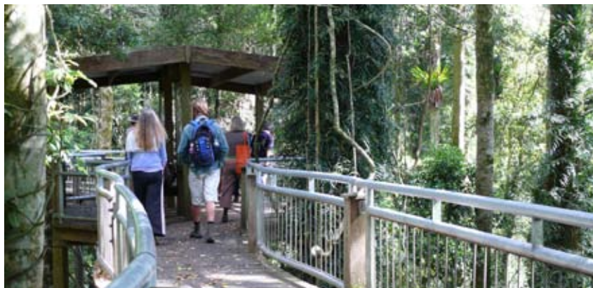
Walk with the Birds

Photos of your group may be taken during this activity for use in National Parks and Wildlife Service promotional products. Please advise any objections.