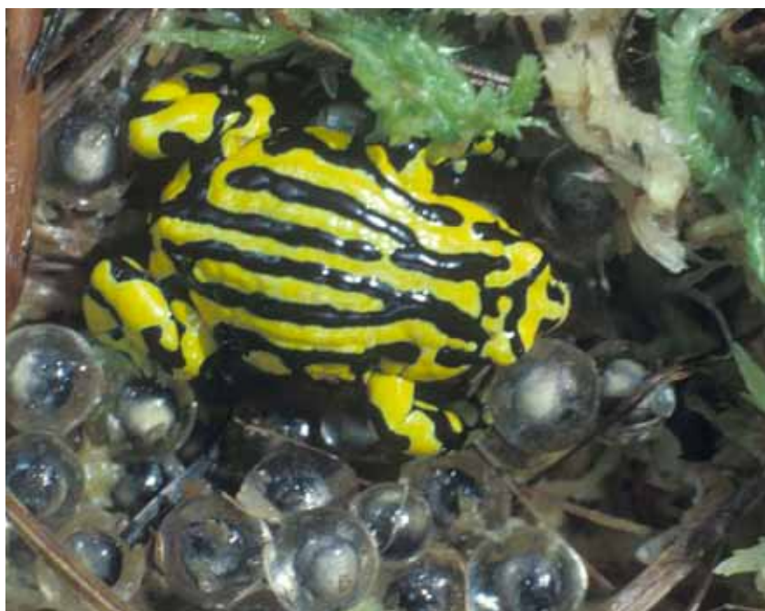
Kosciuszko National Park protects the habitat of the rare and endangered Corroboree frog