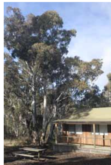
Summer classrooms at the Kosciuszko Education Centre