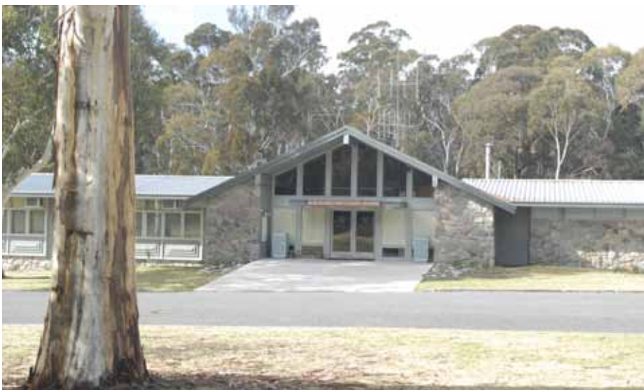
Kosciuszko Education Centre Sawpit Creek