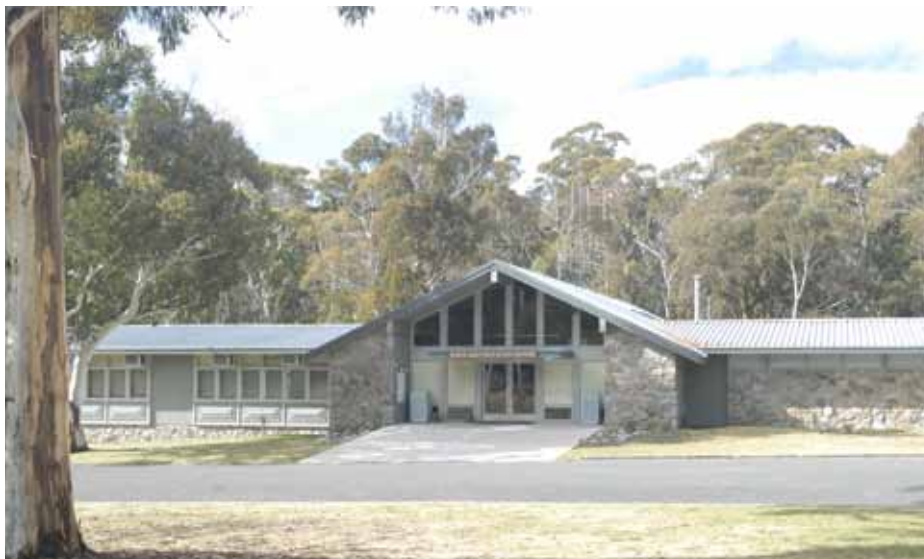
Kosciuszko Education Centre at Sawpit Creek.