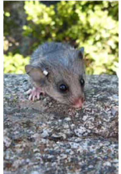
The rare Mountain Pygmy Possum endemic to Kosciuszko National Park