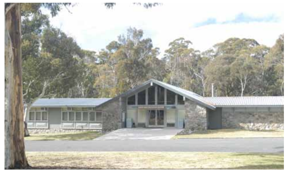
Kosciuszko Education Centre at Sawpit Creek.

Discovery Rangers will guide and encourage students as they participate in activities. The control and supervision of students remains the responsibility of the teacher. It is the responsibility of the school to ensure an adequate number of adult supervisors are present.