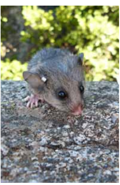
The rare Mountain Pygmy Possum endemic to Kosciuszko National Park