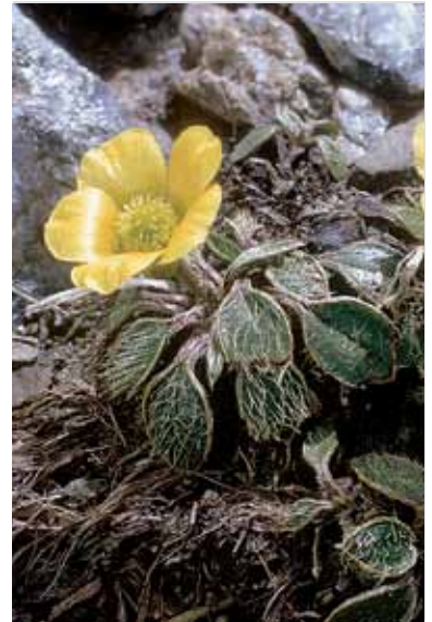
Feldmark buttercup - distinctive hairy leaves to help prevent heat and water loss.