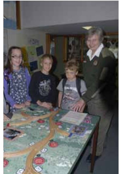
'What Rat is That' the dichotomous key traintrack in the Kosciarium