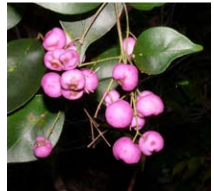
Lilly pilly fruit