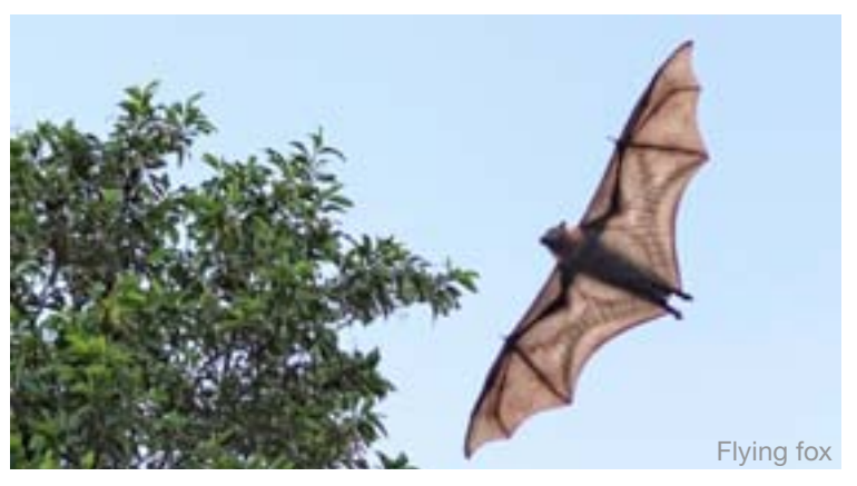
In Kattang, the local Aboriginal language, 'wingan' means 'where bats come to drink'. You may see the bats diving into the river for a drink whilst you are here.